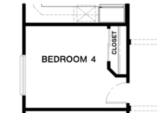
OPT. BEDROOM 4 AT DEN